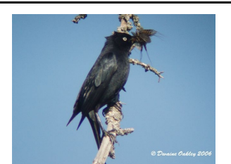
Rusty Blackbird with mayflies