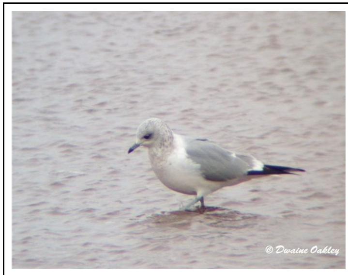
Mew Gull at Souris Causeway mudflats on Dec. 3, 2006