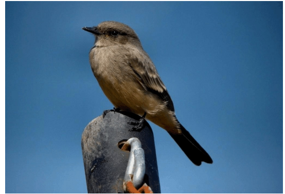
Says Phoebe at Grand Manan

Lark Sparrow - We found a tattered one feeding at the side of the road near Long Eddy