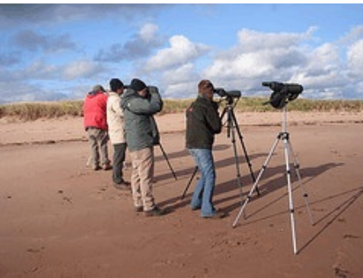
Birding at East Point Beach

The Team started birding at Lake Verde with our first bird being a Canada Goose calling. Fiep used a I-Pod and speakers to play the calls of Saw-whet Owl, Barred Owl, Long Eared Owl, Great Horned Owl, and American Bittern, We tried Lake Verde, Watervale (2 places), Dromore (2 places), Riverton, and Indian Bridge. We were successful in obtaining Northern Saw-whet Owl, Barred Owl, Long-eared Owl, and Great-horned Owl by 0530 hrs and had great views of several shooting stars in the clear sky.