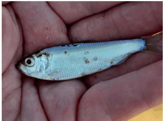
Juvenile alewife or gaspereau from feeding frenzy site at Little Harbour