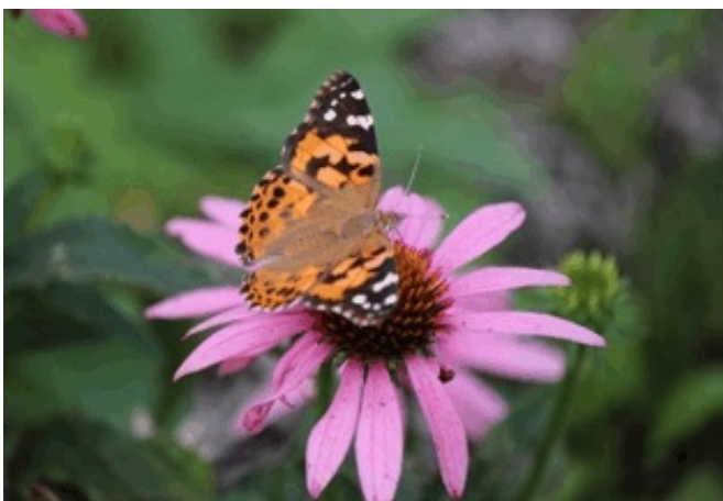
Painted Lady butterfly at Suffolk PE on cone flower Aug. 2012

You can help by making a donation to the Island Nature Trust at P.O. Box 265, Charlottetown, PE C1A 7K4 or by contacting the Trust at 892-7513. Feel free to identify the team to whom you wish make a donation.