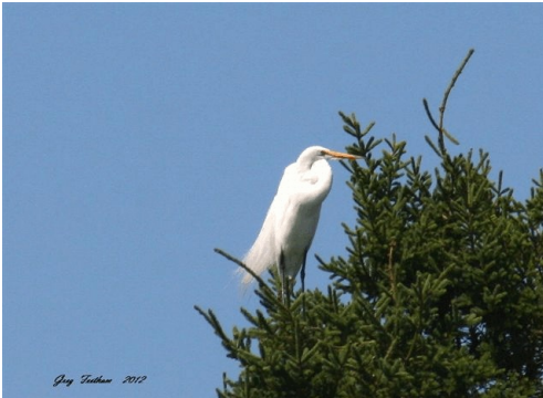
Great Egret at Savage Harbour

BIRDS: Snow Goose - 1 flying with 12 Canada Geese at Desable on Sept. 1 (JDM, LY); Canada Geese - 20 flying at Desable on Sept. 1 (JDM, LY), 125 at Dunk River estuary on Sept 2 (LY), hundreds in air at Bethel on Sept. 19 th (JDM), ~500 in a grainfield at Wilmot (JDM, LY); Wood Ducks - 3 males at Alberton Lagoon on Aug. 1 (DO, JDM), 1 at Borden Lagoons on Sept. 9 (RA); Gadwall - broods present at Alberton lagoon on Aug. 1 (DO, JDM); American Black Duck - ~40 at Wilmot River on Sept. 12 (LY, JDM); Northern Shoveler - 3 at Borden Lagoons on Sept. 9 (RA); Green-winged Teal - 10 at Traveller's Rest pond on Sept. 16 (JDM); Lesser Scaup - 1 at Borden Lagoons on Sept. 9 (RA); Hooded Merganser - 1 seen during air boat surveys at Allisary Creek Impoundment on Sept. 12 (BPD); Hooded Merganser - 1 seen during air boat surveys at Allisary Creek Impoundment on Sept. 12 (BPD); Ruddy Duck - seen during air boat surveys at Allisary Creek Impoundment on Sept. 12 (BPD); Gray Partridge - 20 roadside at Desable on Sept. 1 (JDM); Ring-necked Pheasant - 5 young pheasant (3/4 adult size) on Donagh Road in late August (JDM, LY) and singles seen on Donagh Road in early Sept. (JDM); Ruffed Grouse - 1 on deck at Donagh on Aug. 26 & in tree in Donagh on Sept. 21 (JDM); Sharp-tailed Grouse - 3 adults and 5 young at St. Margaret's on Aug. 21