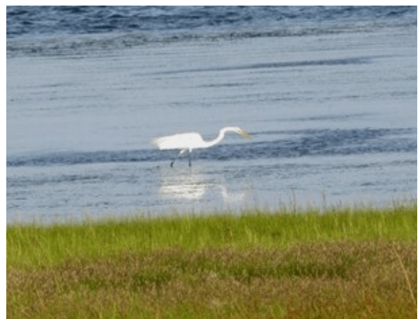
Great Egret in Savage Harbour Bay on Aug. 8, 2012